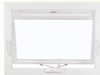
Single vent awning