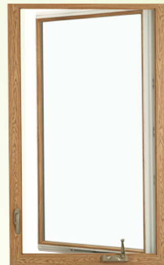
Single vent casement